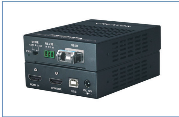
CR-uSF HDMI 200T-D-4K