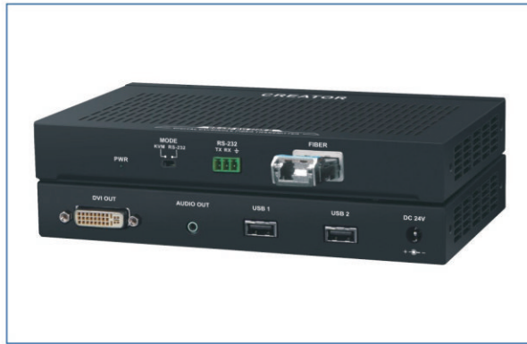
CR-uSF DVI 200R-D