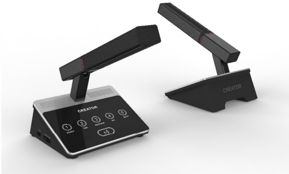
Delegate unit CR-DIG5204X2