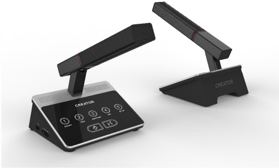
Chairman unit CR-DIG5202X2