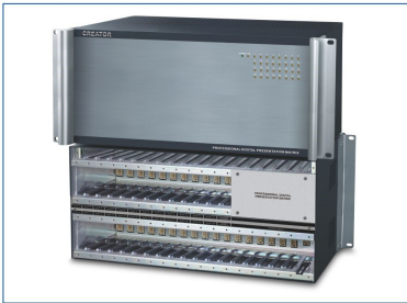
CR-EC-ANY24-II empty chassis