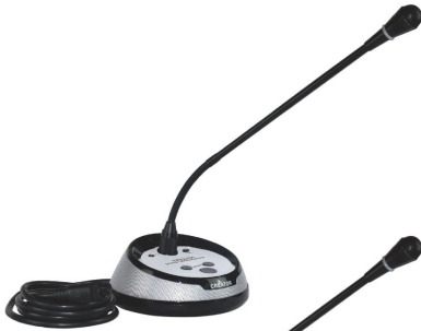
Tabletop discussion chairman unit CR-M4202G