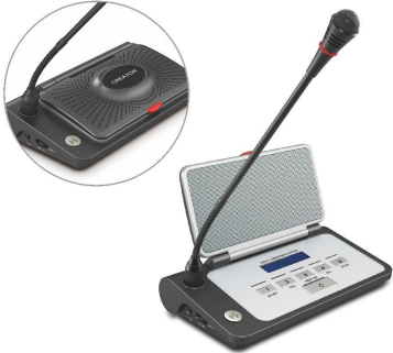
Tabletop discussion & voting chairman unit CR-M4202A2